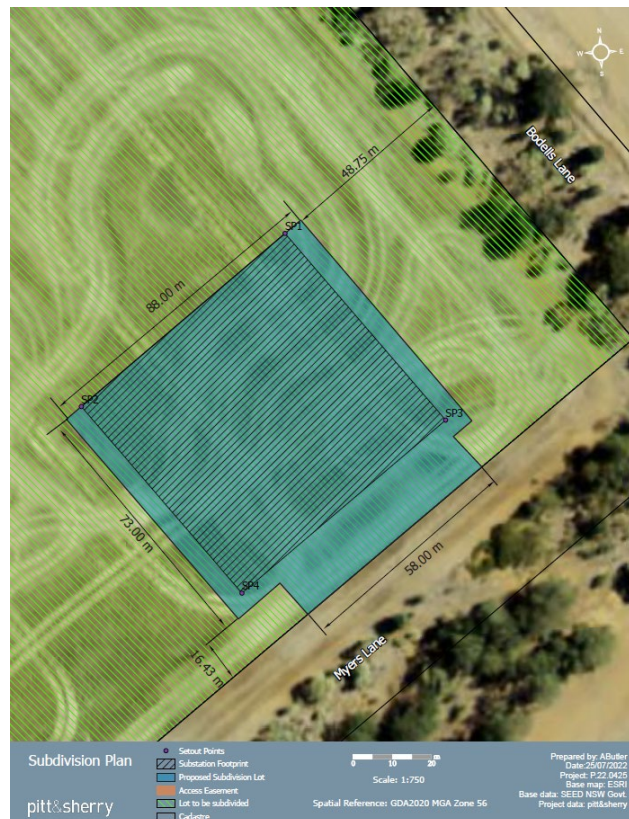
Figure 2 | Proposed subdivision

Lightsource BP has given an undertaking that the modified project will remain substantially the same development as originally approved in accordance with section 100(1) of the Environmental Planning and Assessment Regulation 2021 (EP&A Regulation), and lodged the modification application under section 4.55(1A) of the Environmental Planning and Assessment Act 1979 (EP&A Act).