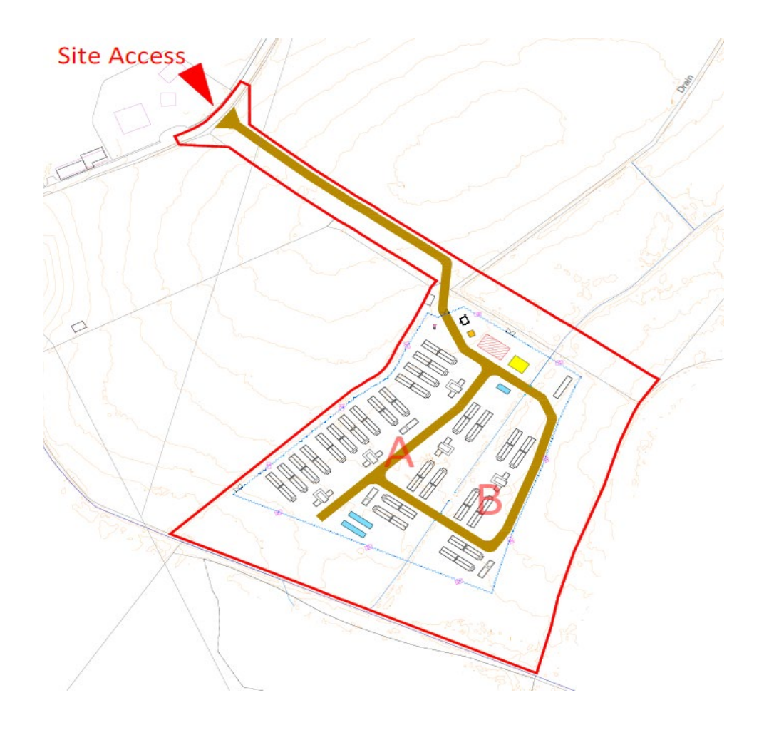
Figure 4: Proposed Layout - November 2023