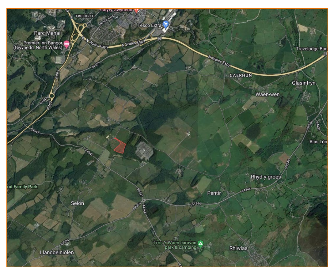
Figure 1: Site Location (Aerial)