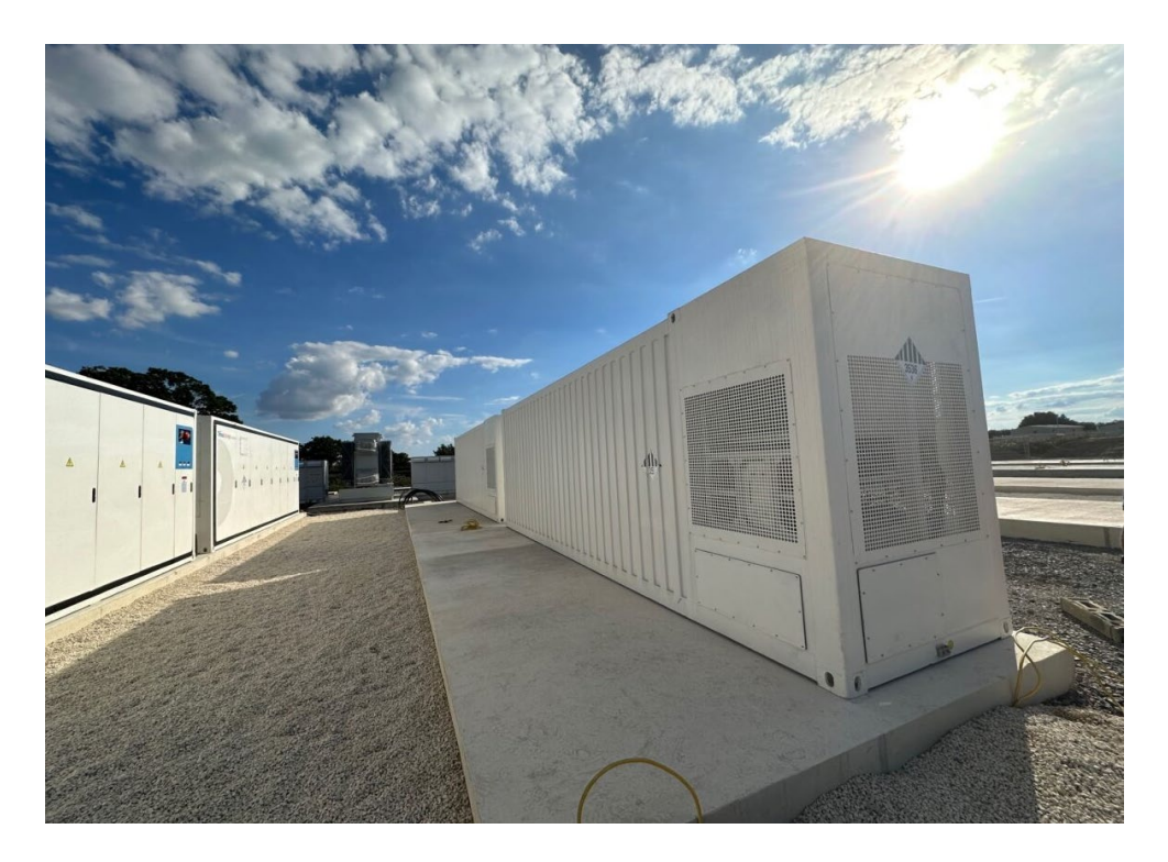
Figure 7: BESS Enclosure - Lightsource bp site at Tiln, Nottinghamshire during construction

5.6.6 The buildings and structures on site are functional and industrial in nature, and this is reflected in their appearance. For reasons of safety, security, robustness, insulation and ventilation, there are few options to soften the appearance of the structures themselves. Consequently, the choice of siting and use of existing and proposed landscaping is the principal means of influencing the impact of a proposed BESS development upon its surroundings. Screening of the various structures is also provided by the proposed 4m acoustic fence which is to be positioned around the northern, western, and southern boundaries.