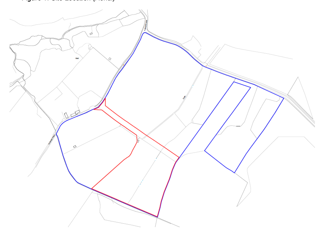
Figure 2: Site Location (OS)