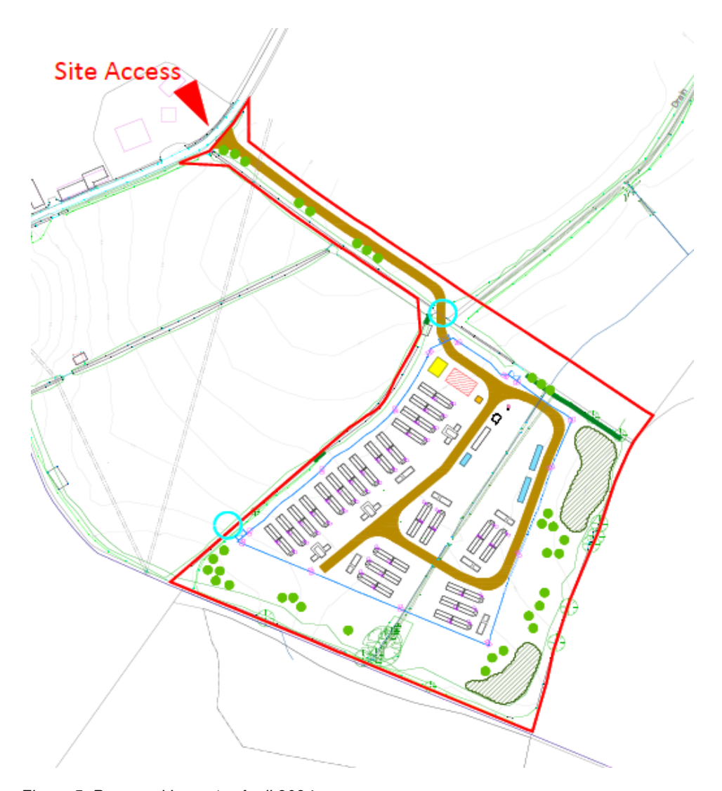
Figure 5: Proposed Layout - April 2024