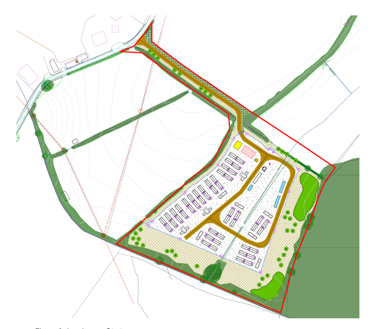
Figure 9: Landscape Strategy