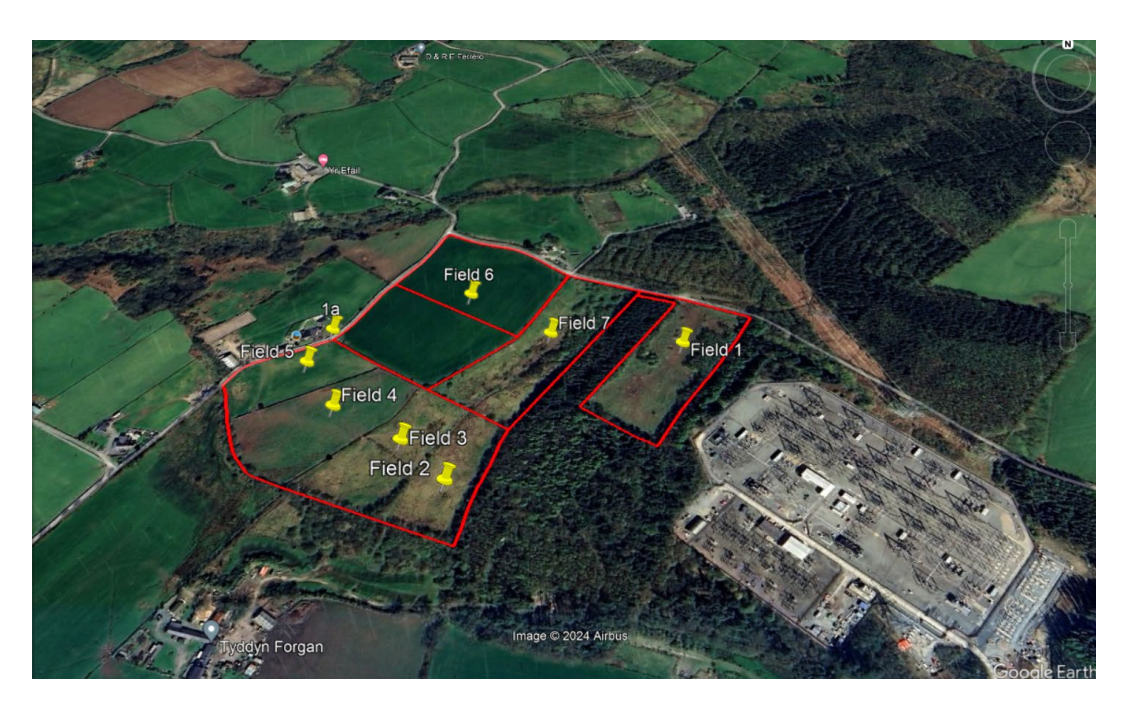
Figure 3: Area of Search