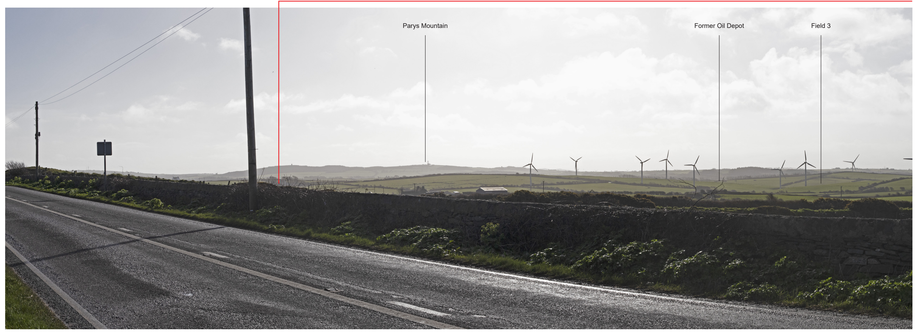
Representative Viewpoint 1 (Left) - A5025 near Buarth-y-Foel between Amlwch and Cemaes within Anglesey National Landscape (AONB)