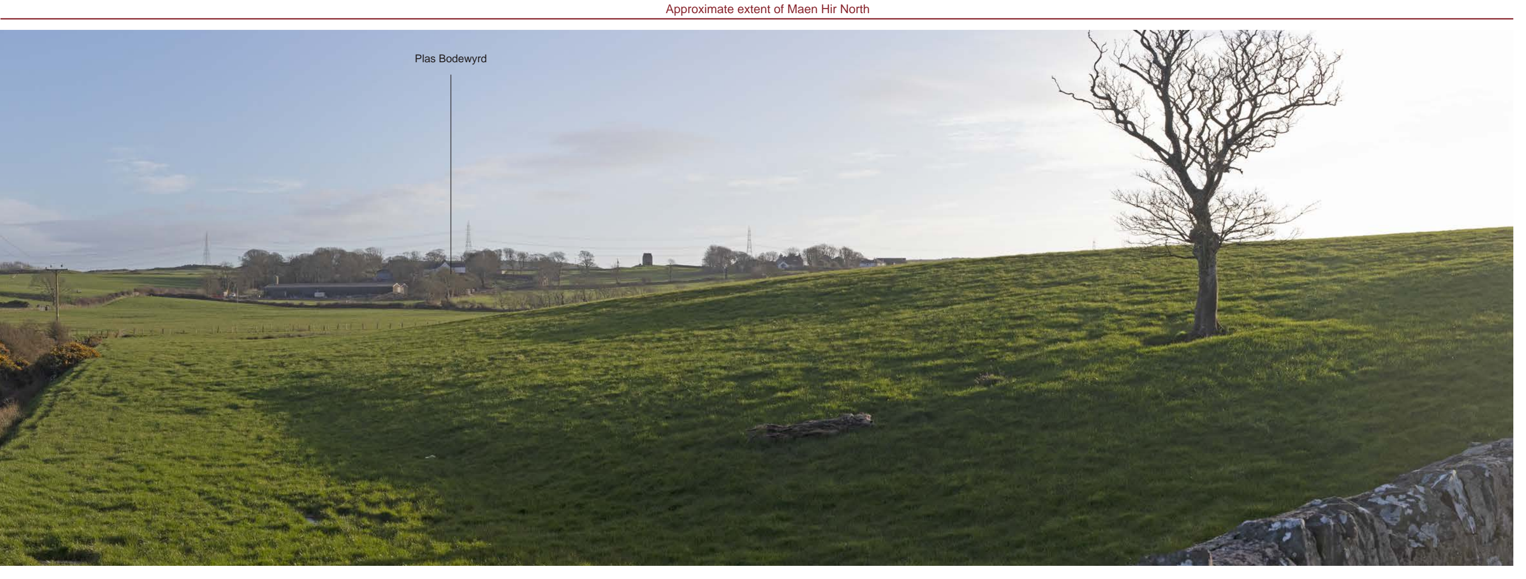
Representative Viewpoint 3 (Right Centre) - Road bridge across Afon Wygr near Hafodllin Bach

ISSUED BY Bristol T: 0117 2033 628 DATE September 2024 DRAWN BF PAGE SIZE 420mm x 297mm CHECKED RF STATUS Final APPROVED RF