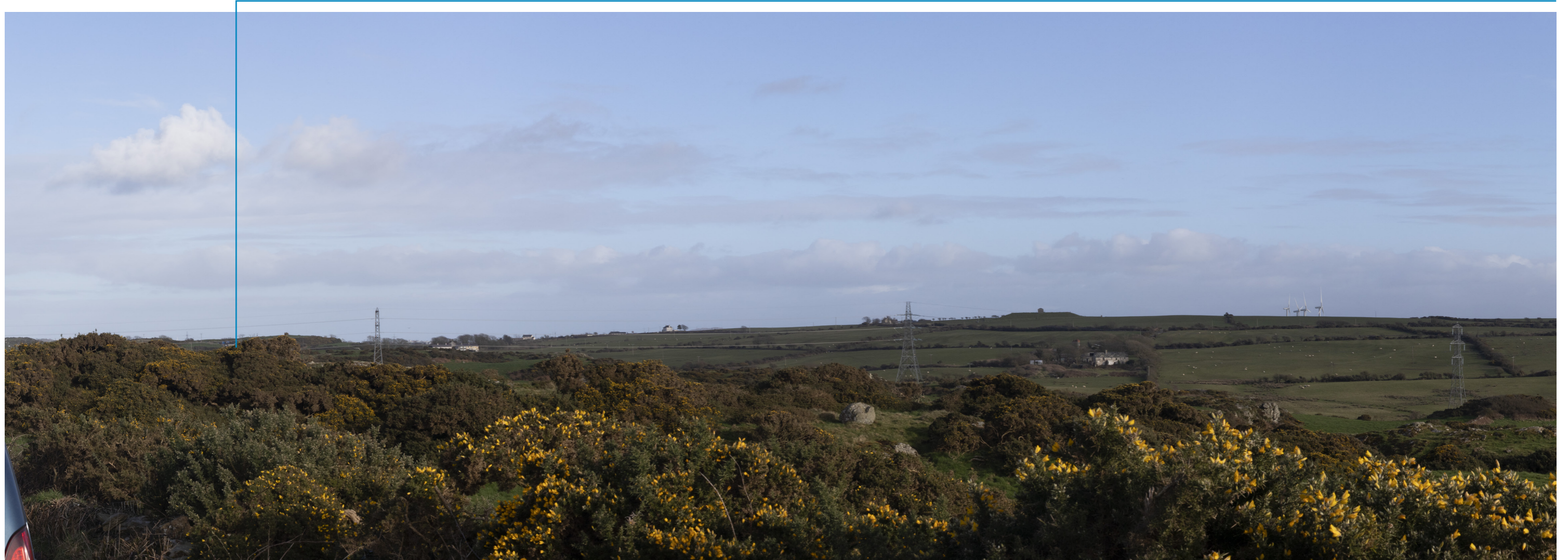
Representative Viewpoint 9 (Left) - Unclassified lane near Pant-y-Gwydd within Mynydd Mechell Special Landscape Area (SLA)