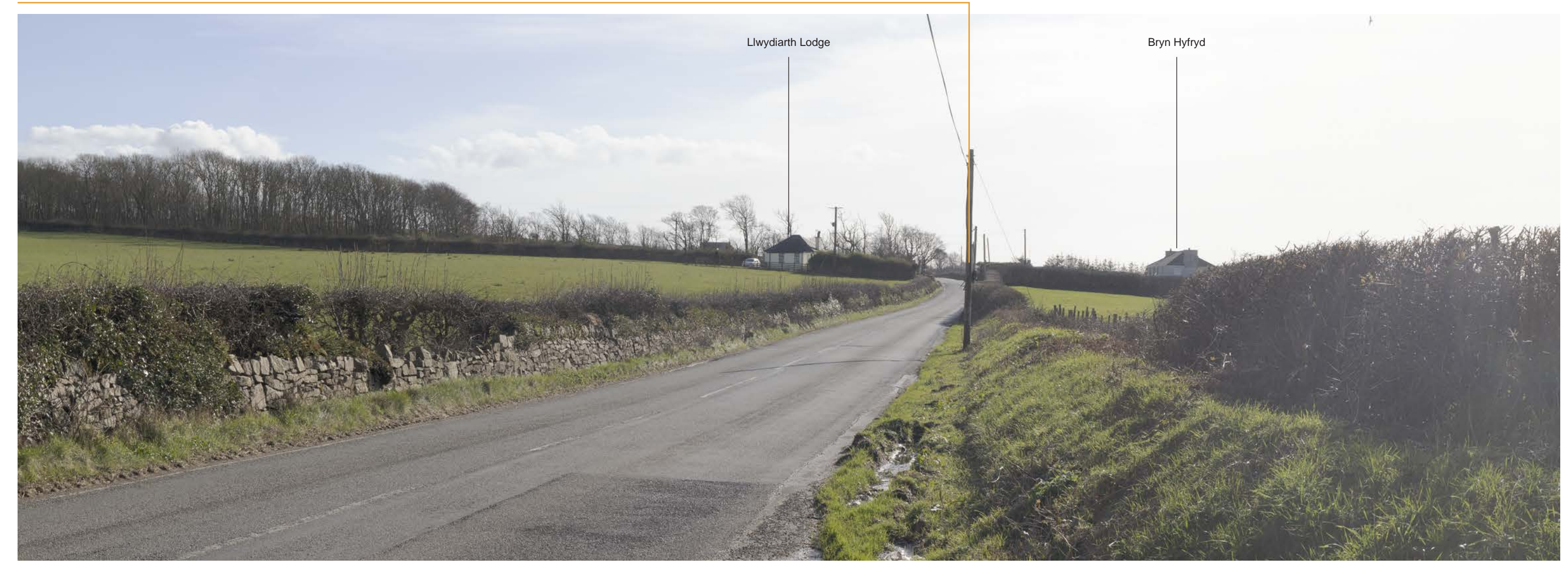
Representative Viewpoint 16 (Right) - B5111 highway to north of Llannerch-y-medd

Approximate extent of Maen Hir South 'A'