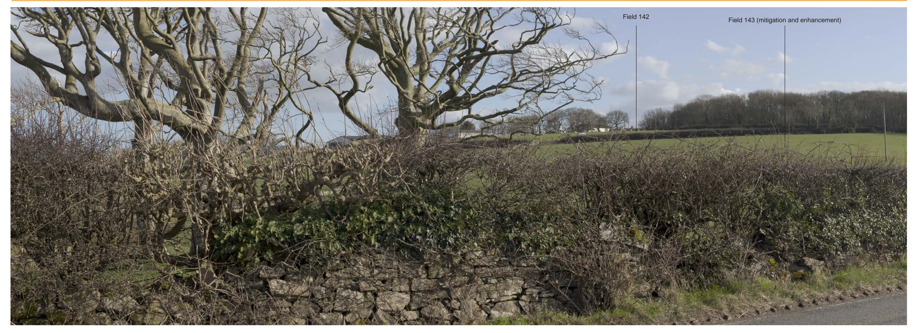
Representative Viewpoint 16 (Centre) - B5111 highway to north of Llannerch-y-medd