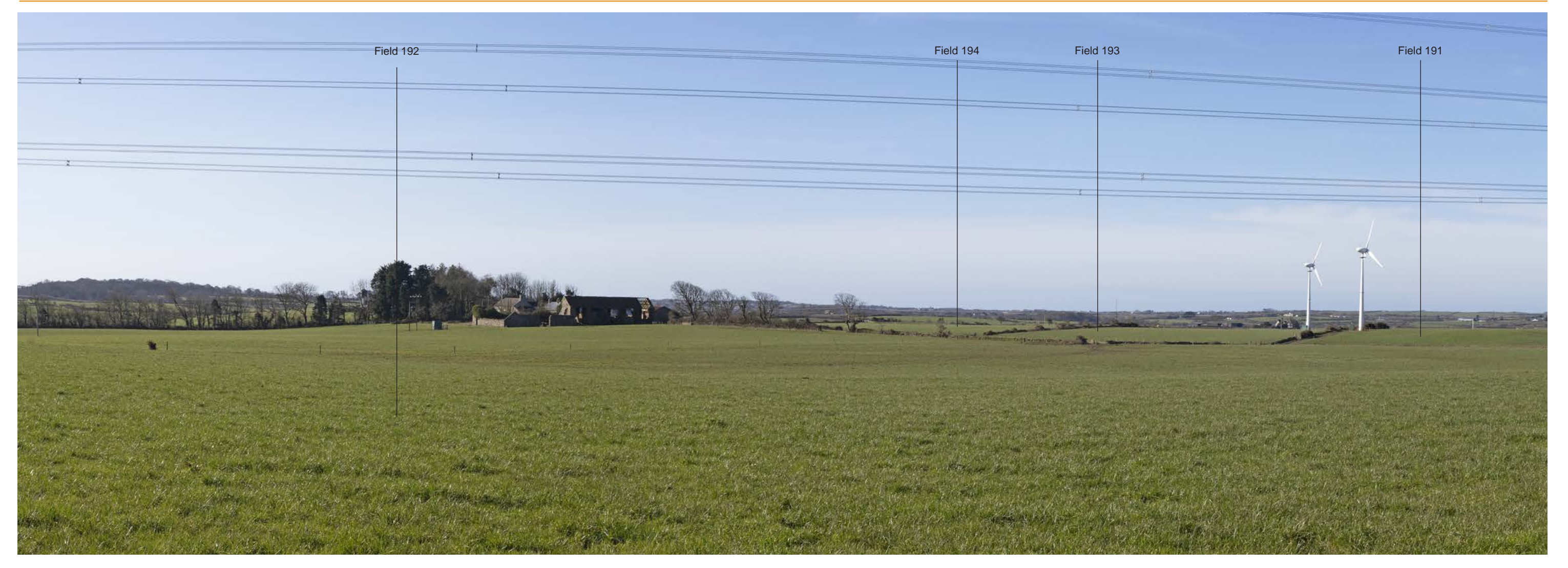
Representative Viewpoint 21 (Centre) - Unclassified lane and National Cycle Route 5 near Llanfihangel Tre'r Beirdd / St. Michael Church to north of Capel Coch