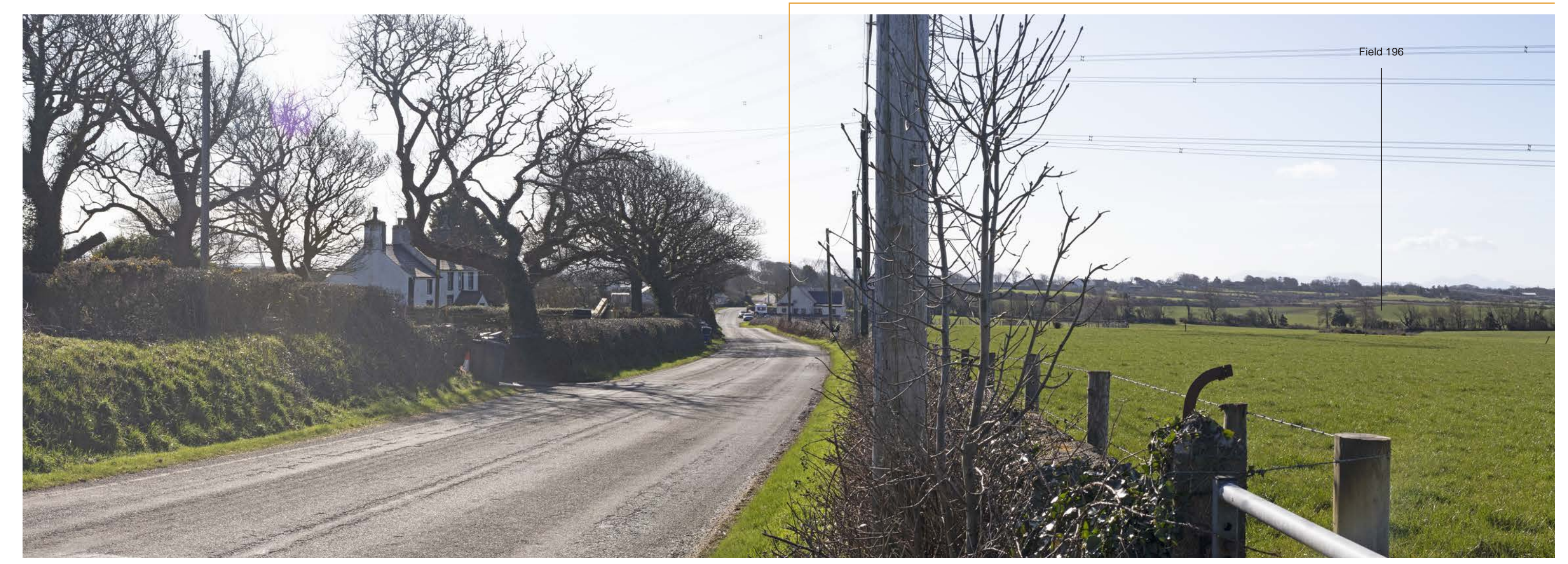
Representative Viewpoint 21 (Left) - Unclassified lane and National Cycle Route 5 near Llanfihangel Tre'r Beirdd / St. Michael Church to north of Capel Coch