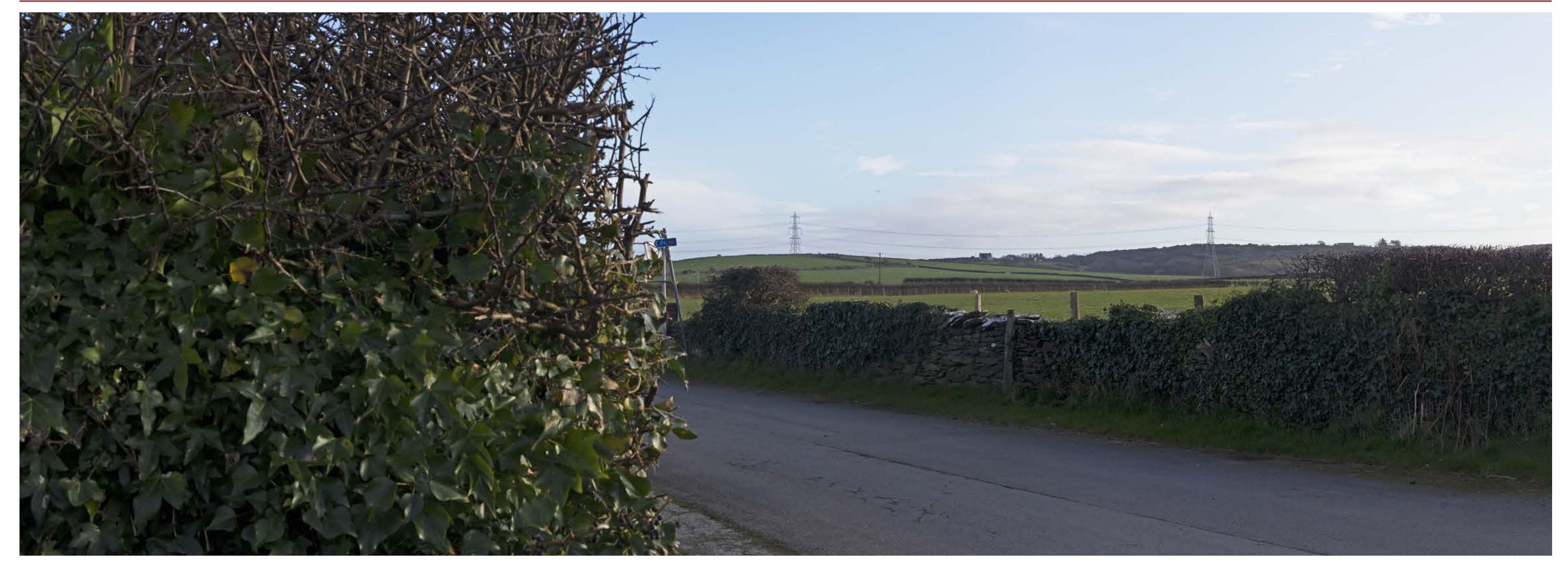
Illustrative Viewpoint F (Centre Right) - Public footpath MECHELL|38/077/2 near Rhosbeirio on junction on unclassified lane (requested by IOACC)

T: 0117 2033 628 ISSUED BY Bristol September 2024 DRAWN DATE PAGE SIZE RF