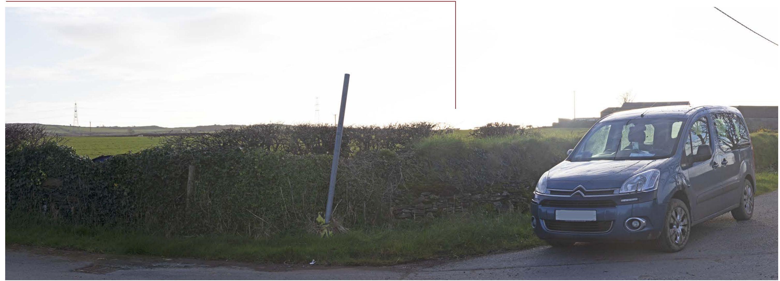
Illustrative Viewpoint F (Right) - Public footpath MECHELL|38/077/2 near Rhosbeirio on junction on unclassified lane (requested by IOACC)