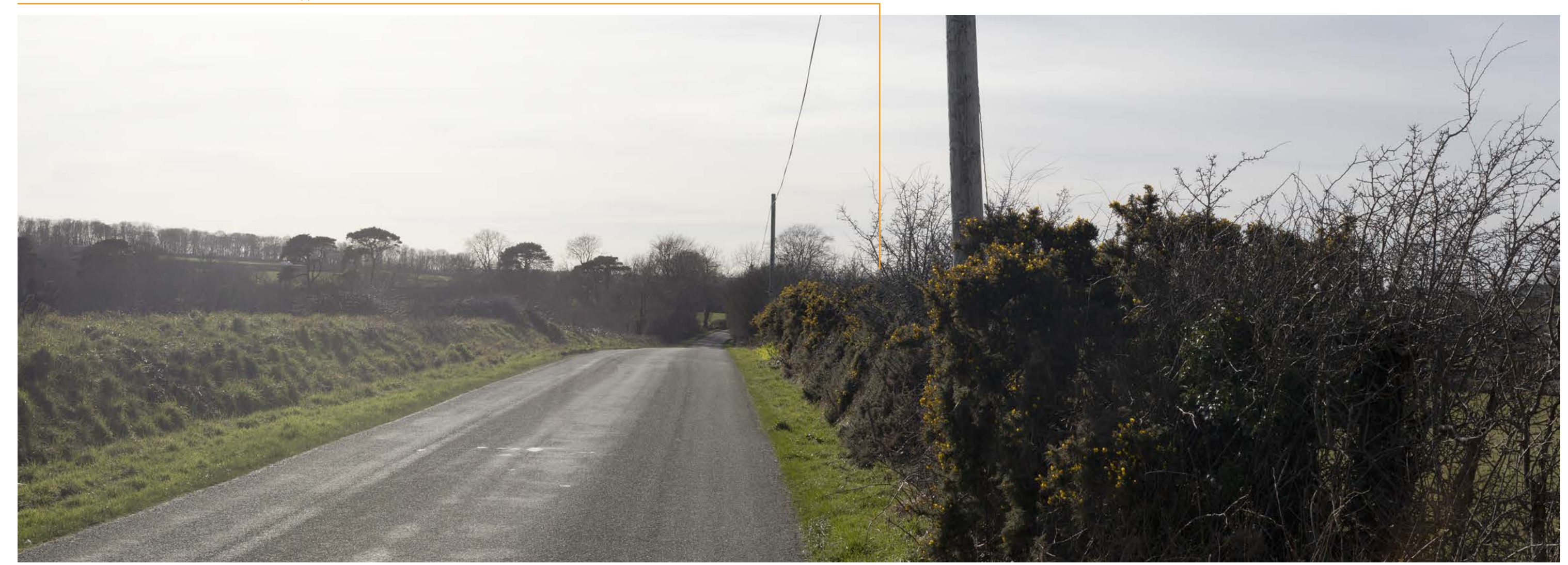
Illustrative Viewpoint P (Right) - Unclassified lane near Ty'n Yr Coed and Dwyran

Approximate extent of Maen Hir South 'A'