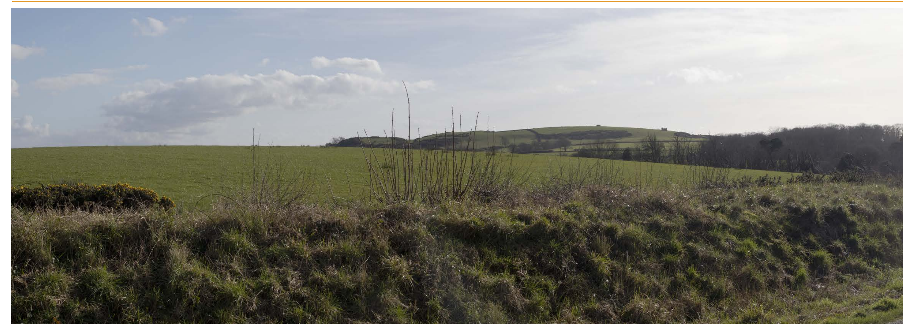
Illustrative Viewpoint P (Centre Right) - Unclassified lane near Ty'n Yr Coed and Dwyran