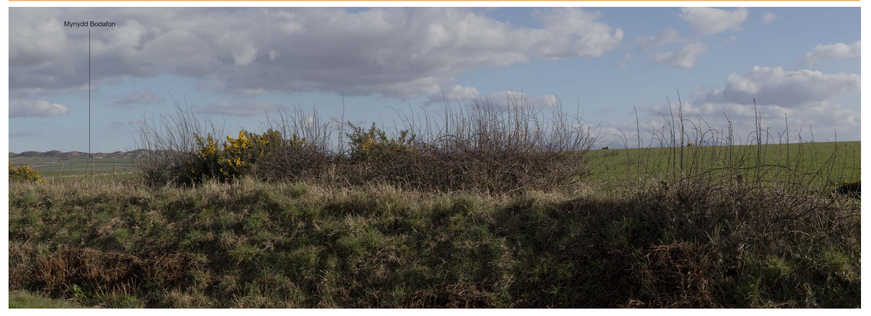
Illustrative Viewpoint P (Centre Left) - Unclassified Iane near Ty'n Yr Coed and Dwyran