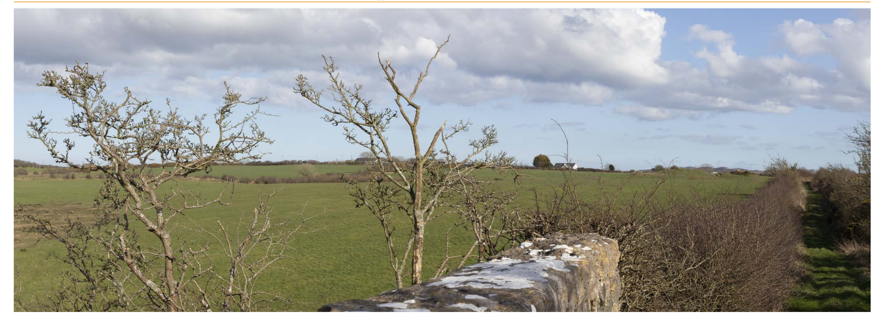
Illustrative Viewpoint Q (Centre Right) - Public footpath LLANNERCH-Y-MEDD|25/003/1 between Ceidio and the B5111 highway

Approximate extent of Maen Hir South 'A'