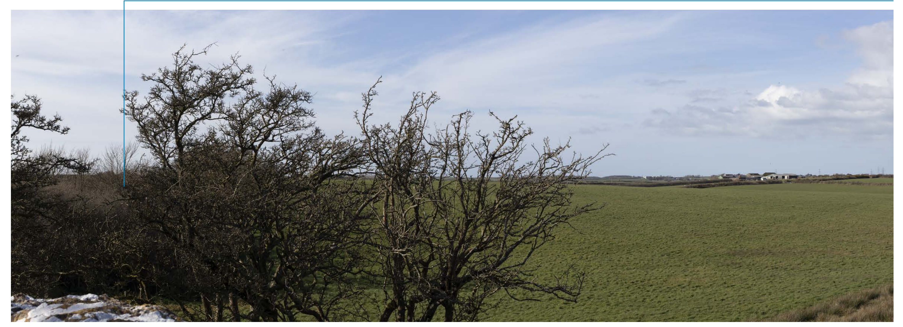
Illustrative Viewpoint Q (Left) - Public footpath LLANNERCH-Y-MEDD|25/003/1 between Ceidio and the B5111 highway

ISSUED BY Bristol T: 0117 2033 628 DATE September 2024 DRAWN BF