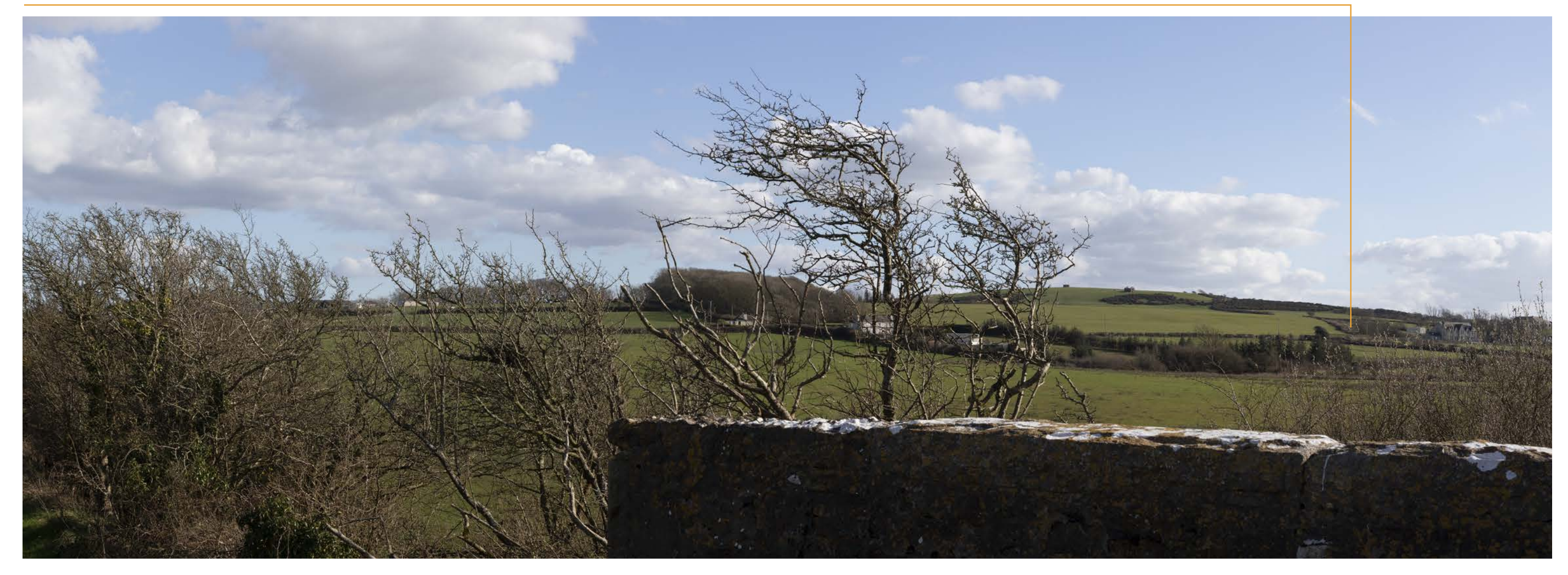
Illustrative Viewpoint Q (Right) - Public footpath LLANNERCH-Y-MEDD|25/003/1 between Ceidio and the B5111 highway

ISSUED BY Bristol T: 0117 2033 628 DATE September 2024 DRAWN BF