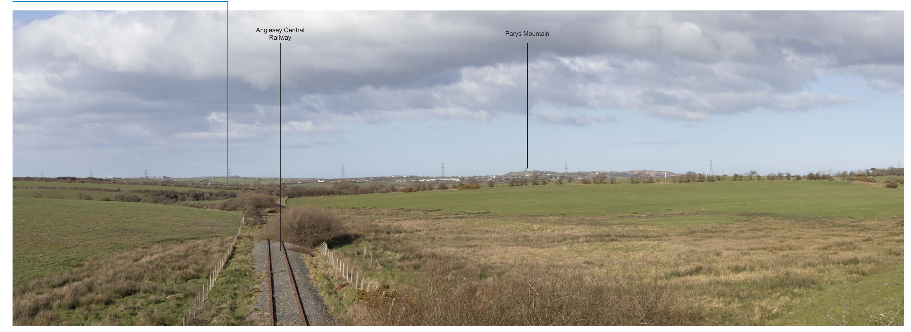
Illustrative Viewpoint Q (Centre Left) - Public footpath LLANNERCH-Y-MEDD|25/003/1 between Ceidio and the B5111 highway