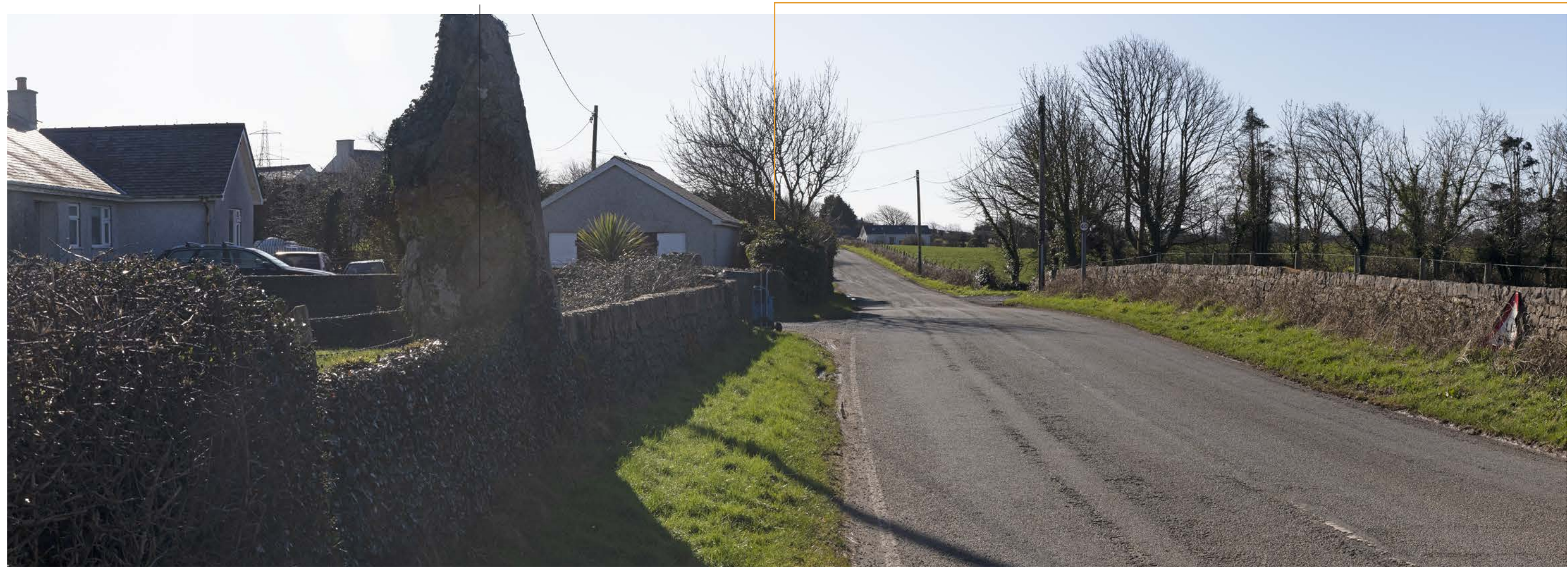
Approximate extent of Maen Hir South 'B'

Illustrative Viewpoint U (Left) - Unclassified Iane and National Cycle Route 5 near standing stone at Maenaddwyn near Cae Fabli