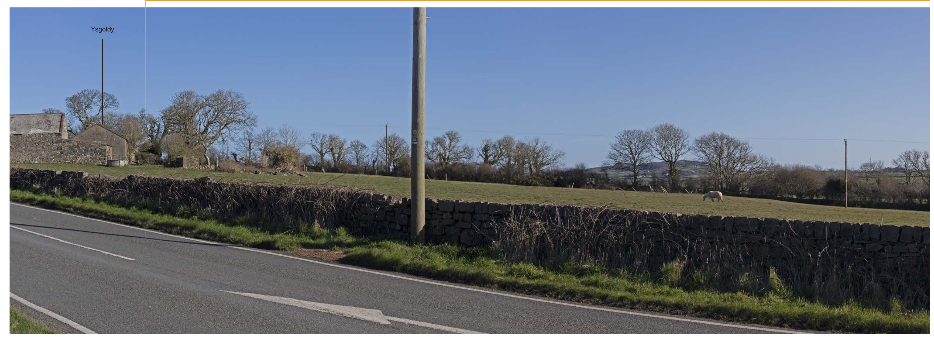
Illustrative Viewpoint Y (Left) - B5111 highway near St Ann's Church, Coedana between Llannerch-y-medd and Rhosmeirch