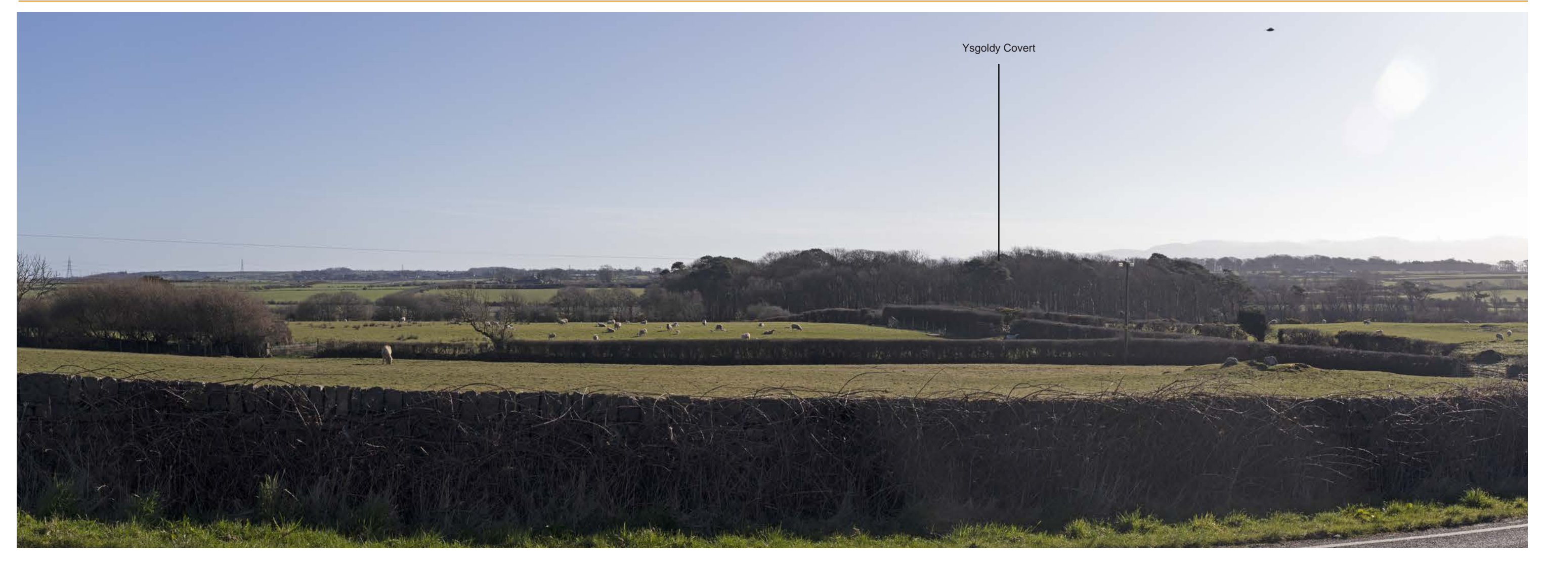
Illustrative Viewpoint Y (Centre) - B5111 highway near St Ann's Church, Coedana between Llannerch-y-medd and Rhosmeirch

ISSUED BY Bristol T: 0117 2033 628 DATE September 2024 DRAWN B