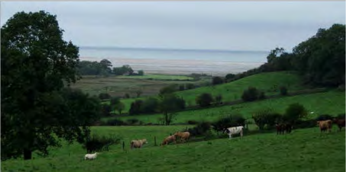
Red Wharf Bay