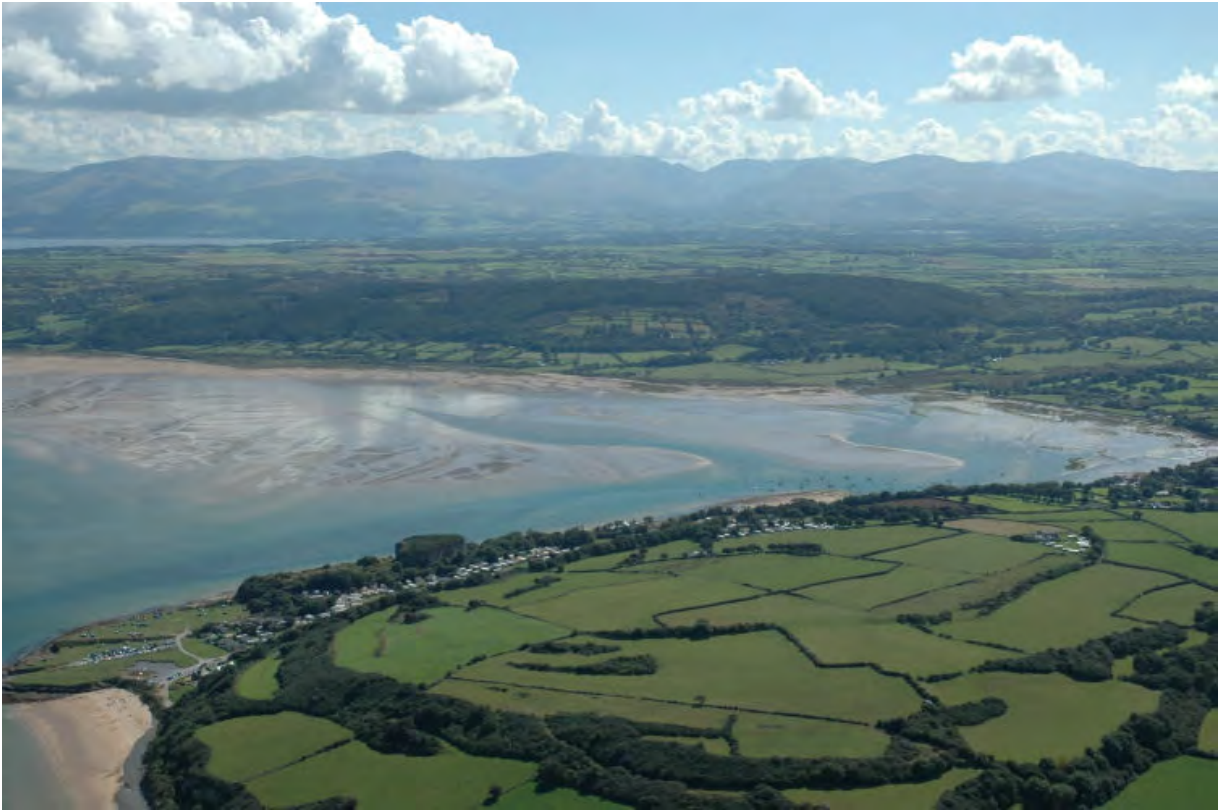
Red Wharf Bay and Llanddona