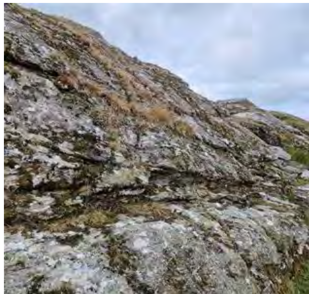
Photograph 16: Other exposure - basic