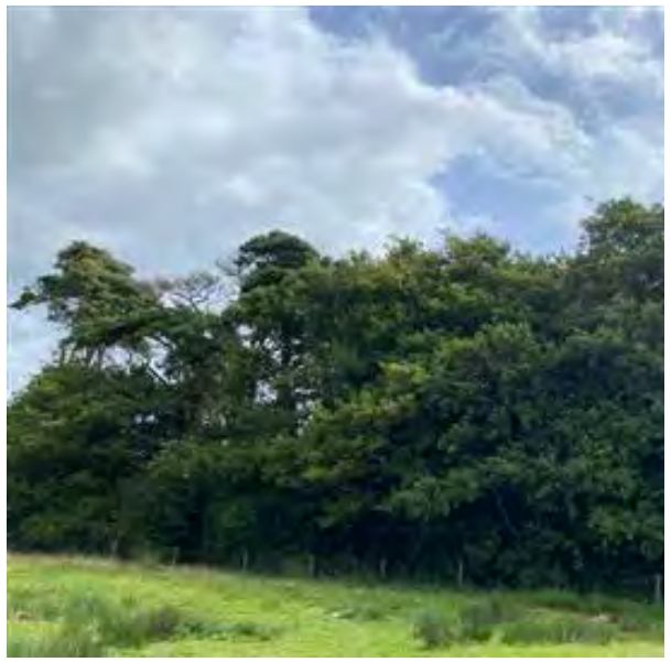
Photograph 4: Mixed woodland – semi natural