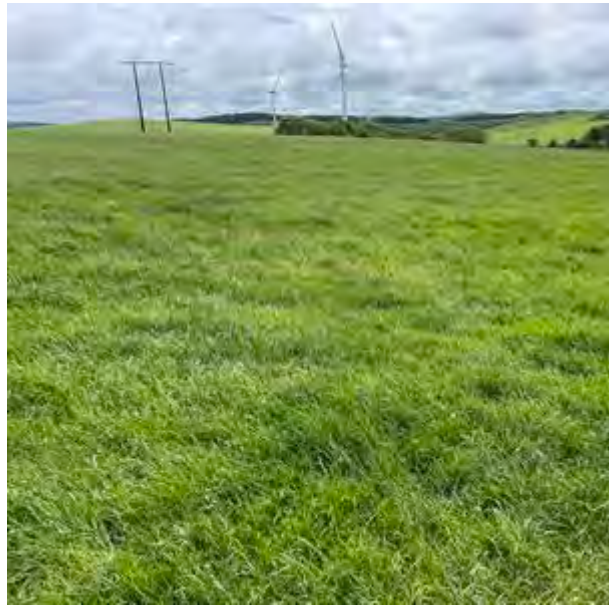
Photograph 10: Improved grassland