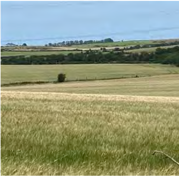
Photograph 17: Cultivated/ disturbed land – arable