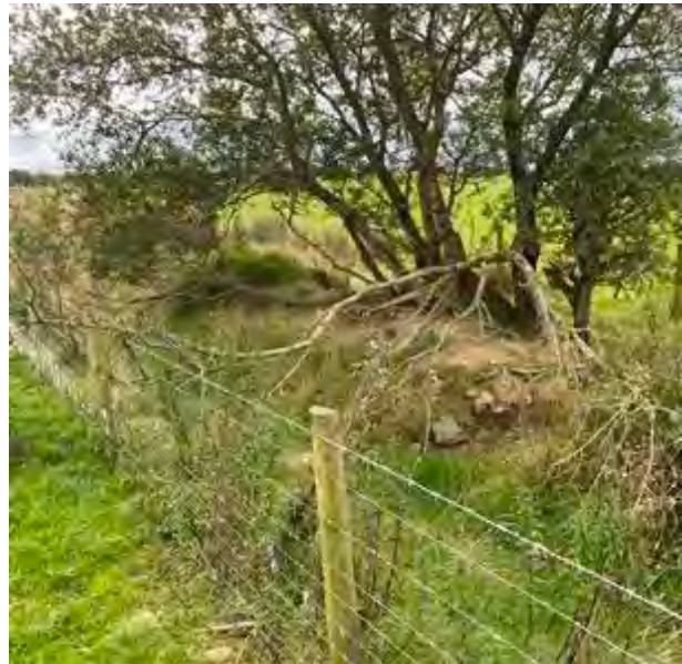
Photograph 18: Species-poor hedgerow with cloddiau. Earth bank and stone wall