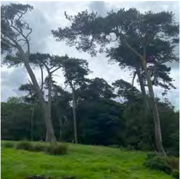
Photograph 7: Coniferous parkland/ scattered trees