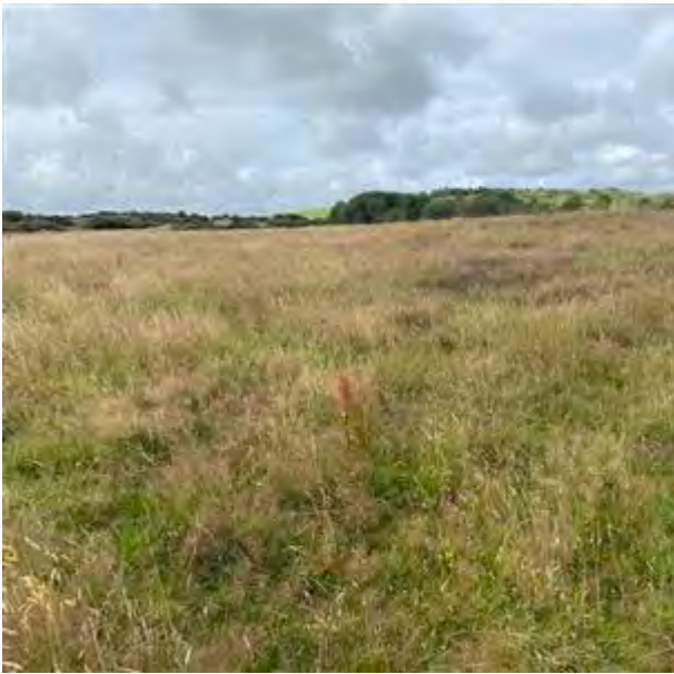
Photograph 9: Neutral grassland – semi-improved