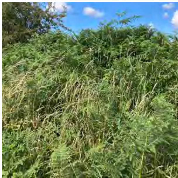
Photograph 12: Bracken – continuous