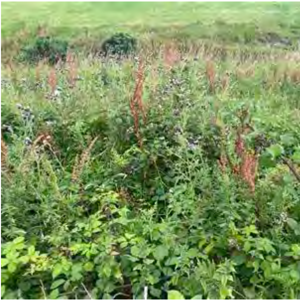
Photograph 13: Other tall herb and fen – ruderal