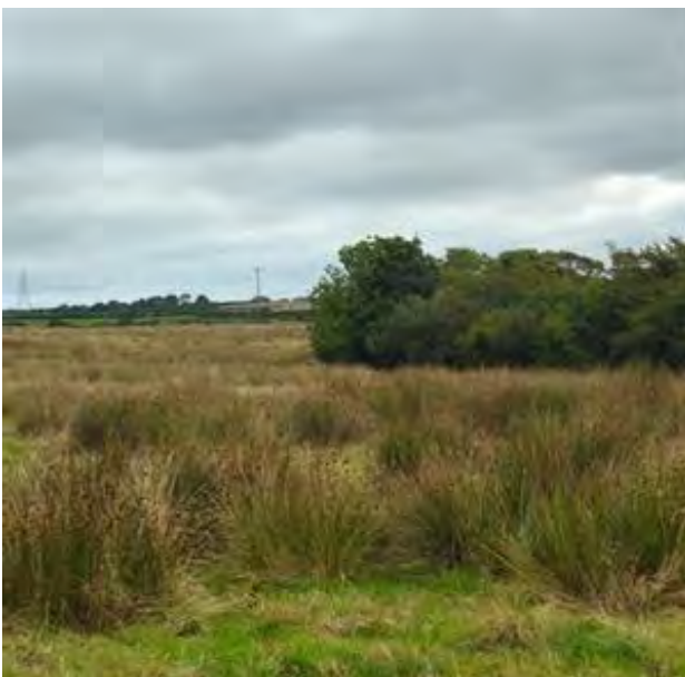
Photograph 11: Marshy grassland