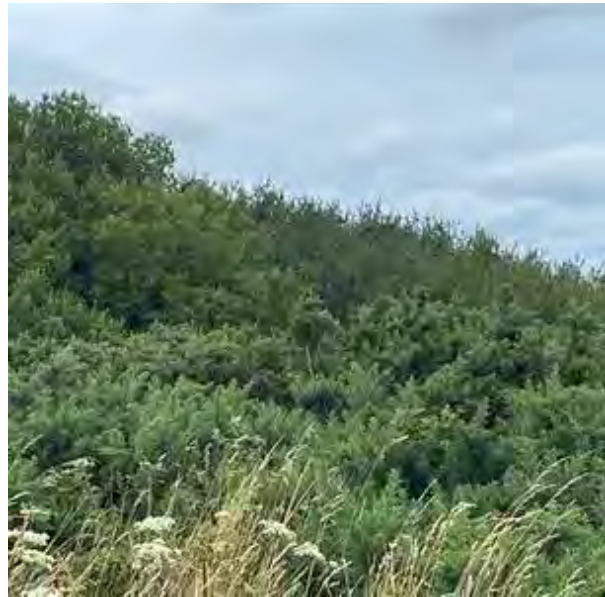
Photograph 6: Dense/continuous scrub