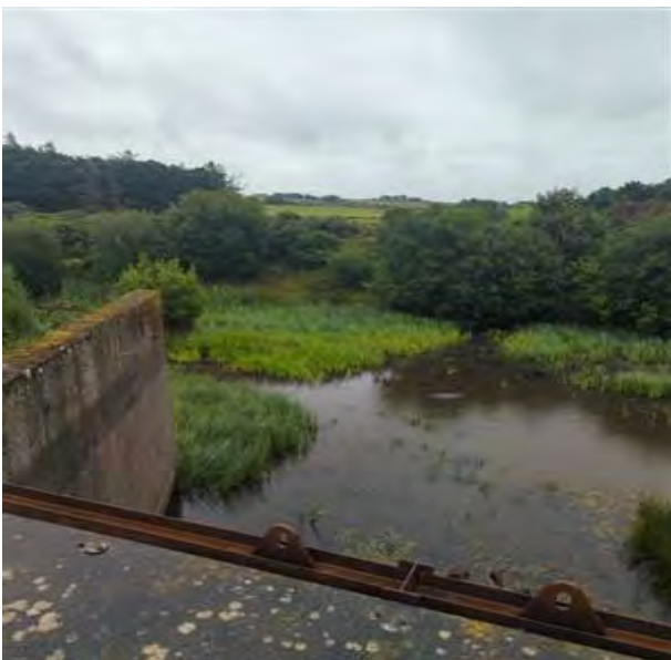
Photograph 15: Standing water