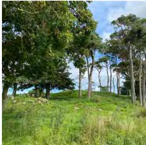
Photograph 8: Mixed parkland/ scattered trees