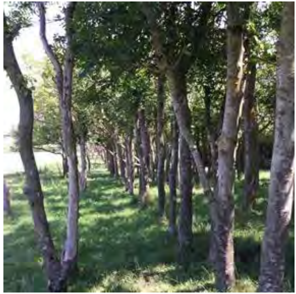
Photograph 2: Broadleaved woodland – plantation