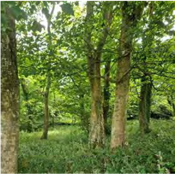
Photograph 1: Broadleaved woodland – semi-natural