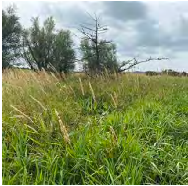
Photograph 14: Swamp