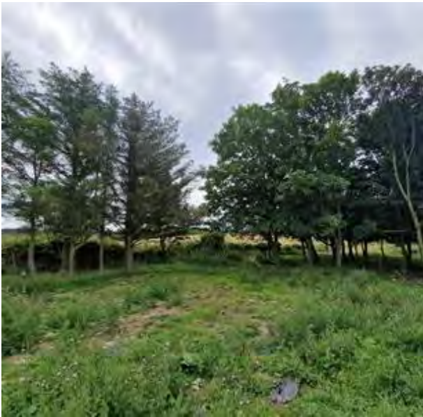
Photograph 5: Mixed woodland - plantation